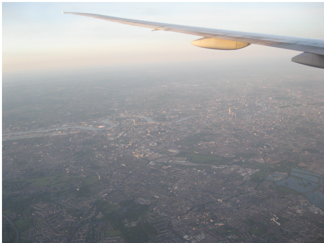
Looking over London

One day, the opportunity arose, so I grabbed it. I planned and organised and before long, I was there.