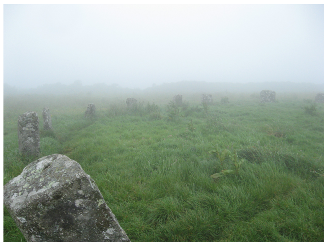
The Merry Maidens

I ventured on in the rain to Penzance to gaze briefly upon St. Michael's Mount at high tide, and then met with the Merry Maidens in the twilight mist, to meditate for some time.