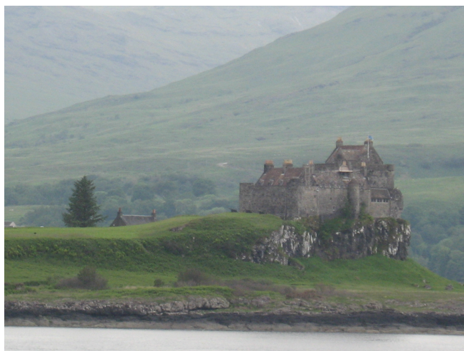
Duart Castle, Isle of Mull

Scotland was the most beautiful landscape I experienced. The weather eased into a warm mid-twenties and clear sky, as I passed many lakes rimmed by mountains, often covered in pines. Picturesque and spacious, a welcome change to the motorway, and prior to that a rather closed-in landscape. I made my way to Oban, a port with ferries leading to many of the isles of the Hebrides. It was beautiful, especially at twilight, with many small fishing boats spread about the bay, the nearby isles visible to the west.