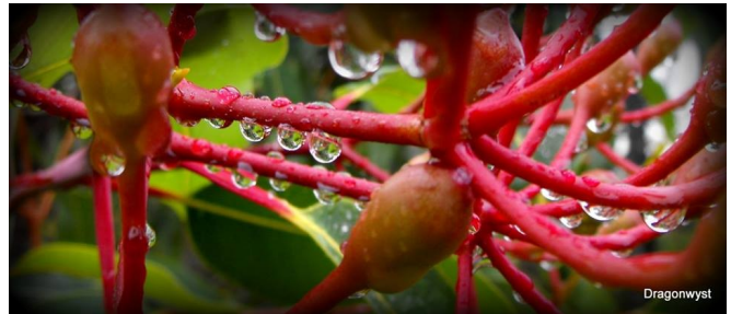
Dragonwyst, In the Baulkham Hills, NSW.