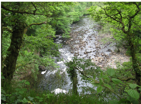
The River Dart, Dartmoor National Park, UK