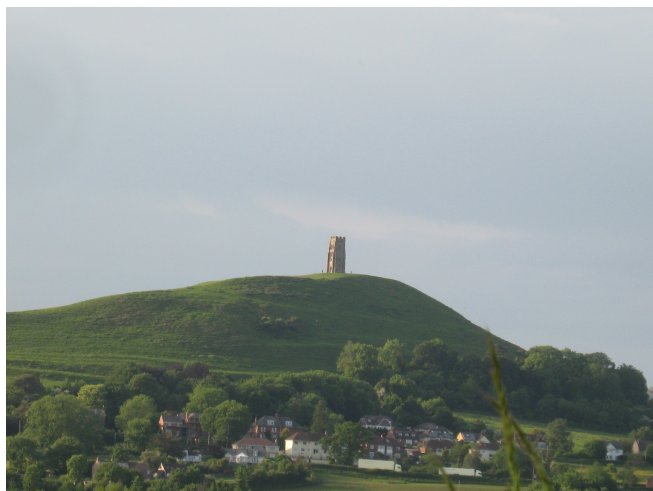
Glastonbury Tor, from the town

integrated with the spirit of place and its pagan displays. I visited the cave-shrine, and climbed the Tor. I hold close the memories of this place.