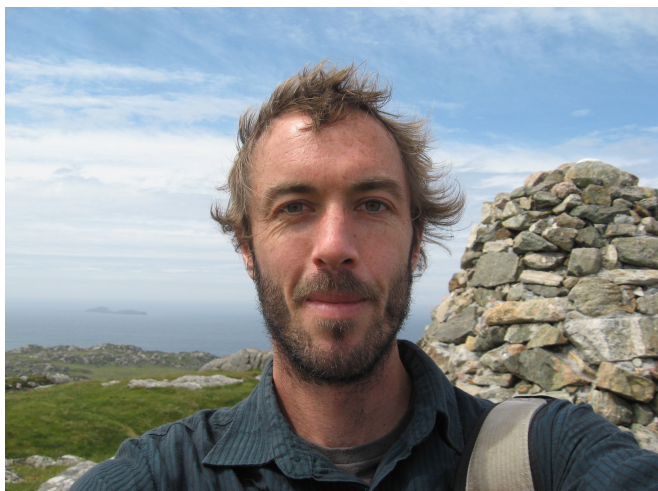
At the top of Dùn Ì, Iona.

My impressions of the place: lambs and soft green lawn, a retreat from the world, a timelessness and the living presence of a spiritual history. It was easy to feel a respect for human spirituality beyond any given creed in this place. Though cold, and certainly more-so in winter, it would make an ideal place for those seeking a hermitage, as St. Columba himself did, and the druids reputed to have lived there before him.