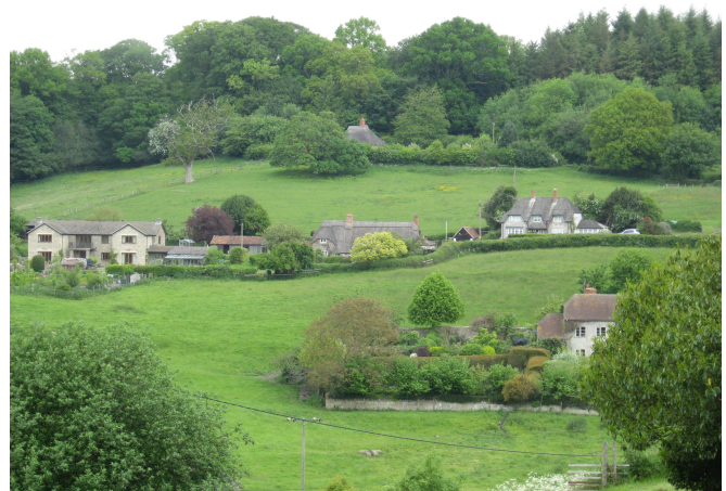
Merry Old England

I left the city with the aid of hire car, and then it hit me: greener than green, so very enchanted: merry climes woven into old pastoral land, dotted with stone cottages and sheep, and dim memories of something far older. The romanticism of the moment overtook me for the next few days, the harmonies of classical music and the rolling green hedge-lined hills carried me somewhere far from the grey city I came from.