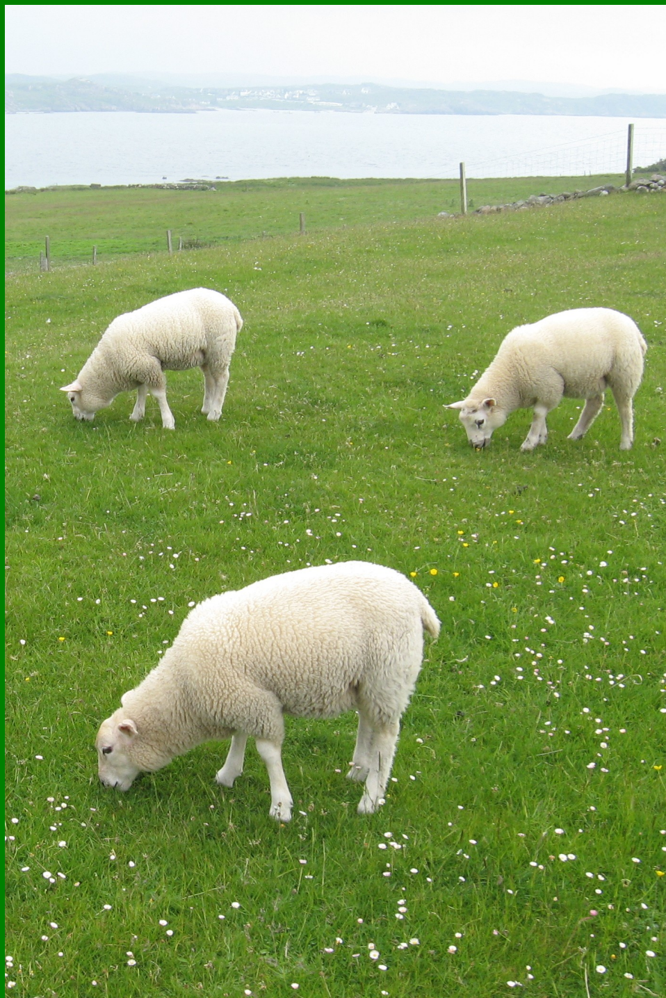
Lambs of Iona

A newsletter for members of the Order of Bards Ovates and Druids in the Southern Hemisphere