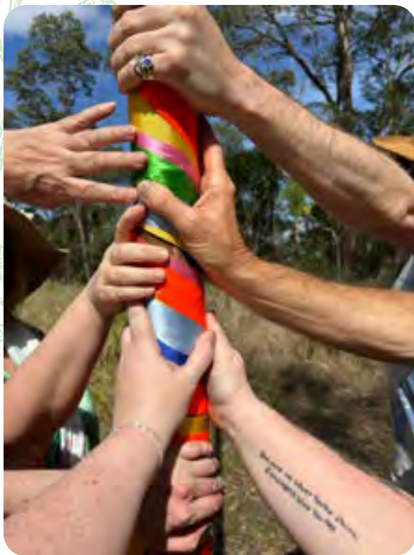
A quick callback to Beltane 2024 for the Macadamia Grove, where we had a Bel-pole!