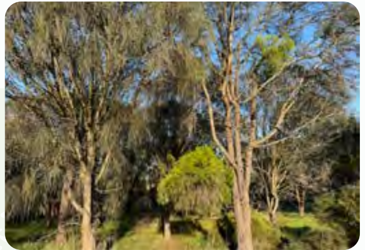
The Western gateway to the Peace Grove

We all felt there is a great need at this time for this work and we had answered a call to be here.