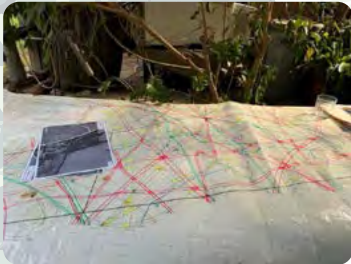
Dowsing and ley lines

We meditated daily, each Druid leading a meditation as we worked with the cosmic mysteries, looked at our own healing and how together we can be of service. There was time for learning, reflection and rest, music, fresh food from the garden and from the sea and because we had two birthdays, way too many French pastisseries!