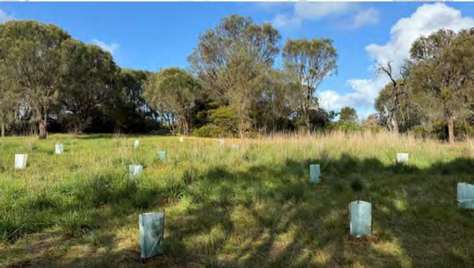
The Peace Grove