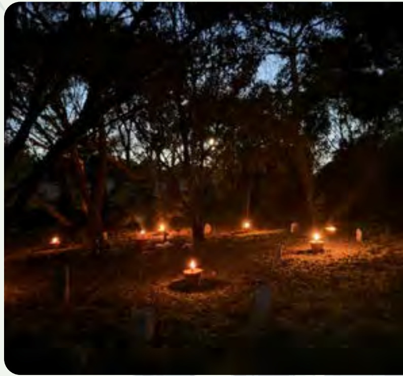
The full moon ritual