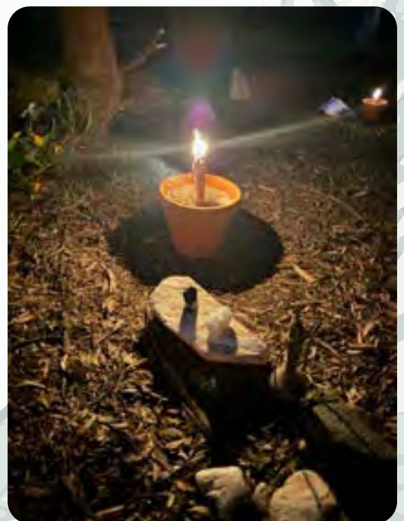
The full moon peace ritual

One task was to plant a Peace grove and at the start of the week we dowsed, set the inner circle and starting planting trees up on the hill. The Grove is nestled within a space surrounded by she-oaks, mallees, wattles and hakeas. The new trees have their big guardians all around them and it is quite protected. Trees were planted and named with a copper label. We planted for Druids who have passed, ourselves and Druids who couldn't be here but wished to add their thread of connection to the Peace Grove. On Alban Eiler, locals came and planted trees also and after the ceremony we blessed the grove as the sun went down, lighting up the mistle-toe in the Western gateway. We wrote a Wassail for the trees which was sang many times over the course of planting.