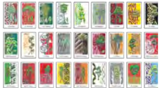
Oracle Cards Set

For more information and to purchase a copy of 'The Trees Speak', and prints of the tree spirit paintings, visit the website: thetreespeak.co.nz