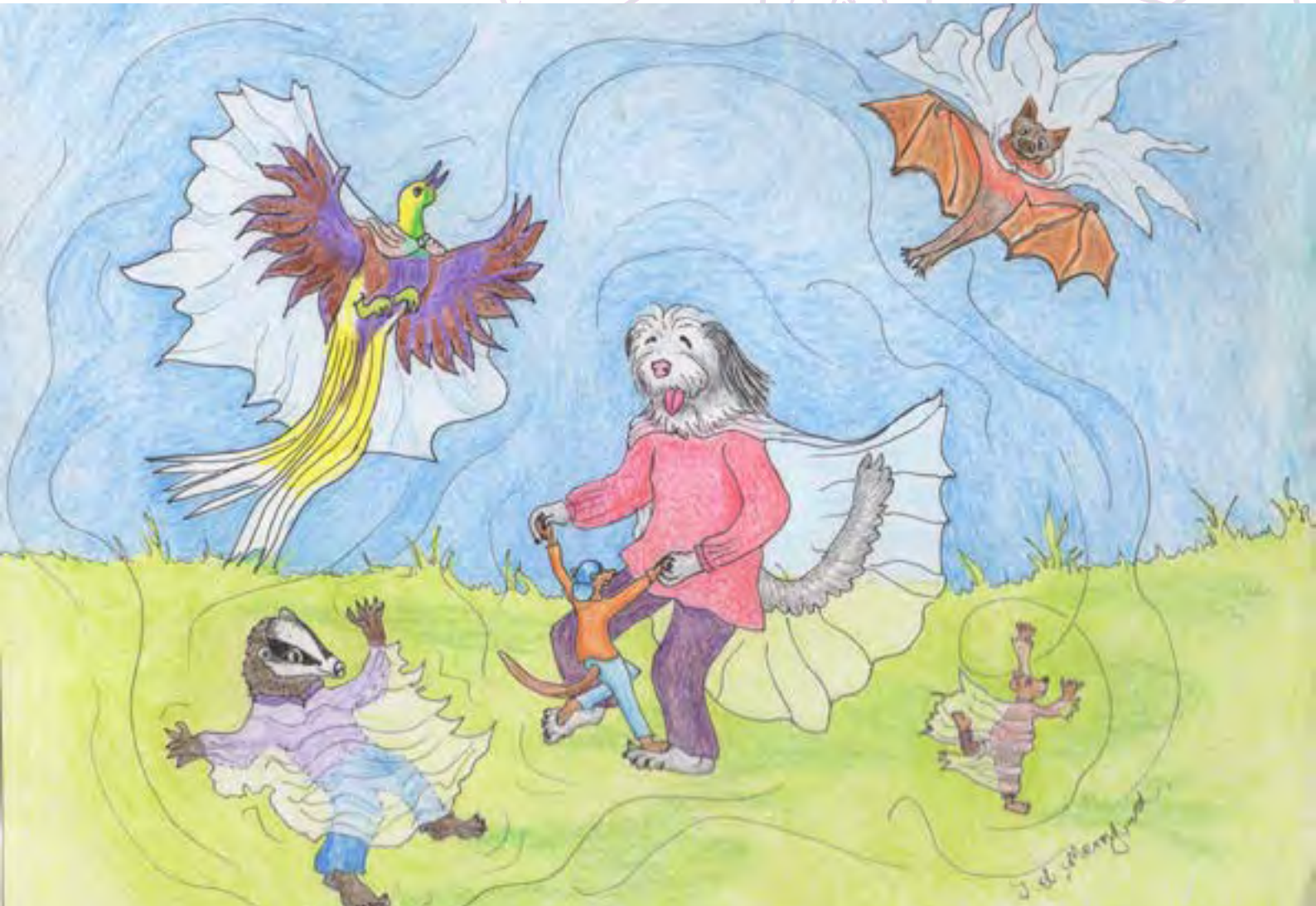
Romney the Shepherd doing a dad dance with his Ragamuffin ward, at the festival of the season of Gateling in which everyone wore diaphanous robes and did a joyful moon-dance

Guide to using Tarot for playing Wanderhome solo is here: https://teasugarsalt.itch.io/the-wanderhome-key-to-the-tarot