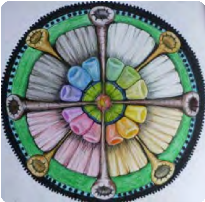
Artwork by wyverne ogma vynyán

At Beltane, we open to the God and Goddess of Youth. However old we are, Spring makes us feel young again, and at Beltane we jump over the fires of vitality and youth and allow that vitality to enliven and heal us. When young we might use this time as an opportunity to connect to our sensuality in a positive creative way, and when older the mating that we seek might well be one of the feminine and masculine sides of our nature.