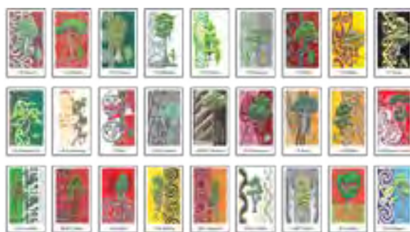
Oracle Cards Set

For more information and to purchase a copy of 'The Trees Speak', and prints of the tree spirit paintings, visit the website: thetreespeak.co.nz