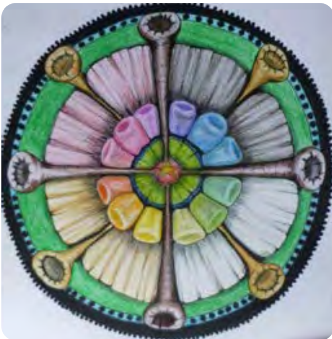
Artwork by wyverne ogma vynyian

At this time, our ancestors saw the Sun, the weak and helpless Child of Light, grow stronger day by day. The land still lies in darkness, but the rule of the darkness is challenged by the infant Lord of Light. Little by little, the skies grow light and the blessed Earth gives forth her first flowers, snowdrop and crocus, as promise of the Summer that is to be when all creation will rejoice in the One Universal Light.