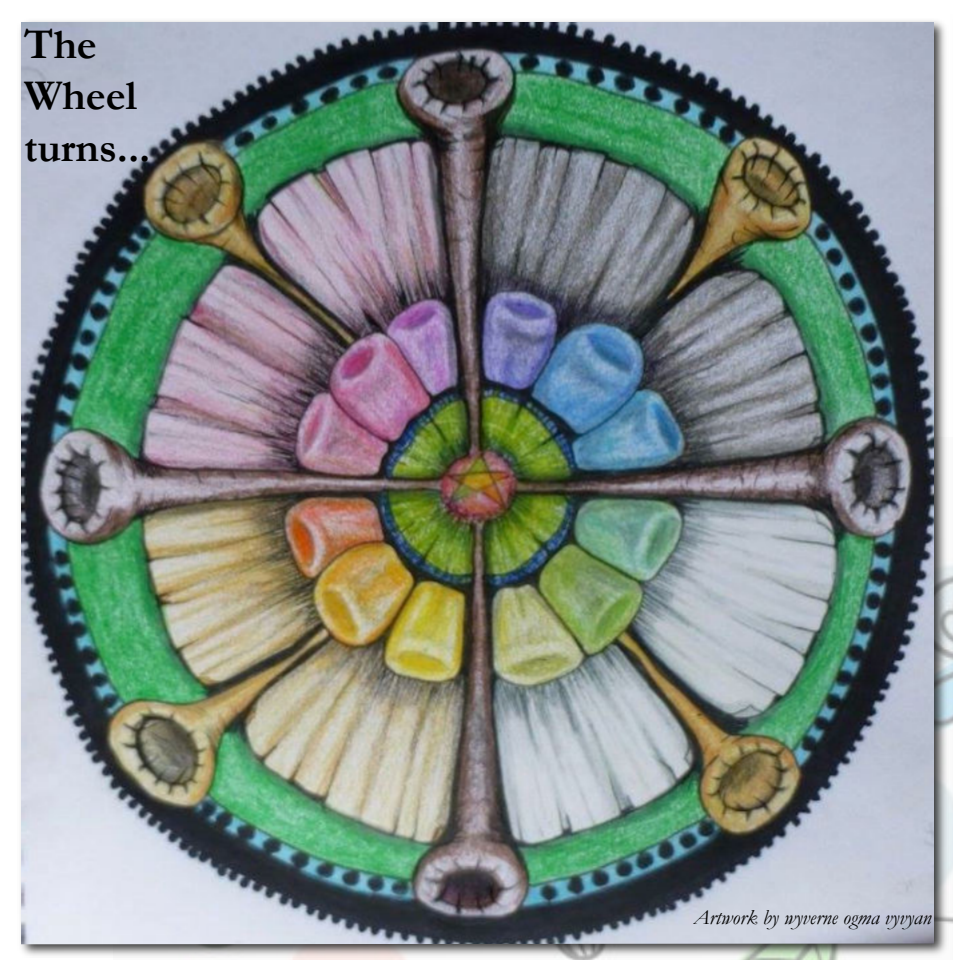
The deadline for contributing to the Beltane issue of SerpentStar is 26 October 2020. The Beltane issue will be released in the week of 31 October 2020.

Although we would think of Imbolc as being in the midst of Winter, it represents in fact the first of a trio of Spring celebrations, since it is the time of the first appearance of the snowdrop, and of the melting of the snows and the clearing of the debris of Winter. It is a time when we sense the first glimmer of Spring, and when the lambs are born. In the Druid tradition it is a gentle, beautiful festival in which the Mother Goddess is honoured with eight candles rising out of the water at the centre of the ceremonial circle.